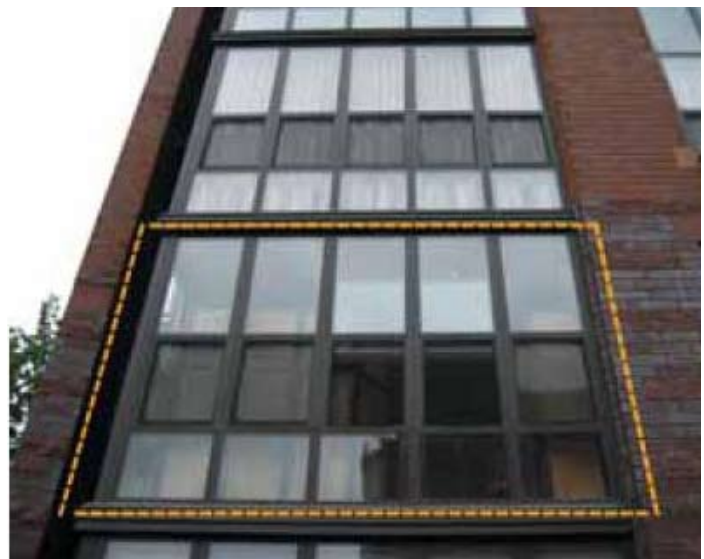
Figure 4 - Although comprised of both fixed and operable lites, the area of the rough opening is used to determine air infiltration and not the individual lite. Isolating the individual lite during testing can prove useful in determining possible areas of excessive air leakage.

used to calculate net air infiltration through that assembly includes, by definition, the entire square foot area of the assembly, including the sub-frame (Figure 4), and not the individual lite as tested to gain AAMA-designation. This can fundamentally alter project-specific test results for a window wall assembly, often leading to confusion regarding what constitutes a “passing” grade during pre-construction mock-up and or field air infiltration testing. The standards, as currently written must be thoroughly understood by the design professional or construction specifier when crafting the specification.