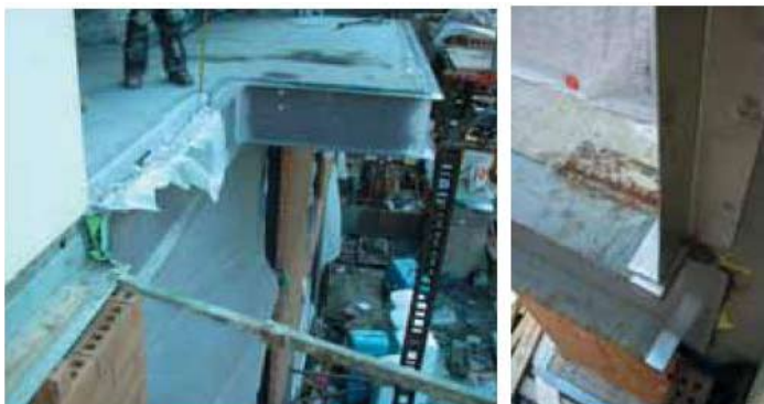
Figures 5.1 and 5.2 - Problematic slab edge interfaces require special attention.

The cladding at the slab edge adds further complexity and is typically the weakest aspect of both the performance and design of the window wall (Figures 5.1 and 5.2).