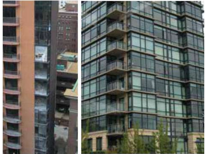
Figures 1.1 and 1.2 - Cantilevered bays of window wall assemblies typical in high-rise residential construction.

This is particularly critical with post-tensioned concrete slabs such as those typically utilized in high-rise residential construction, where allowable design live and dead load deflection at the center of continuous spans often results in 3/8 in. (9.7 mm) of movement, unless factors more stringent due to use/occupancy, or requirements of the initial design program are outlined. At cantilevered slabs such as those typically associated with projecting bay windows and window wall “stacks” this can be an important consideration (Figures 1.1 and 1.2).